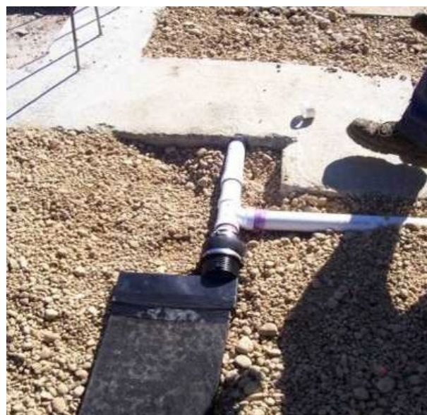
Figure 3. Photograph of a low-profile vent and vent pipes.