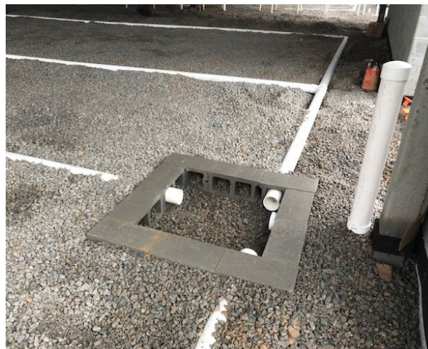
Figure 5. Photograph of a header for mitigation system piping.