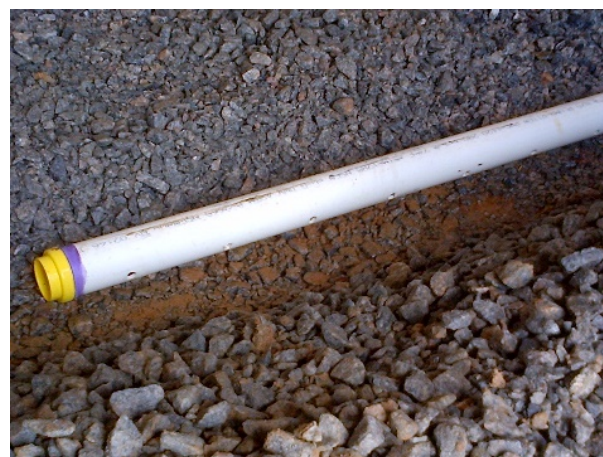
Figure 4. Photograph of mitigation system piping.