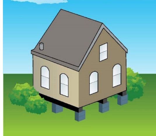
Figure 2. Schematic of a block and beam foundation.

This passive VI mitigation method uses natural or mechanically enhanced ventilation to mitigate potential VI risks and is most applicable within: (1) geographic locations where a raised building foundation is the preferred style of foundation construction; (2) existing buildings with a raised foundation; or (3) new buildings slated for construction on top of contaminated sites where lower potential VI risks are determined to be present, especially at sites impacted with petroleum hydrocarbons.