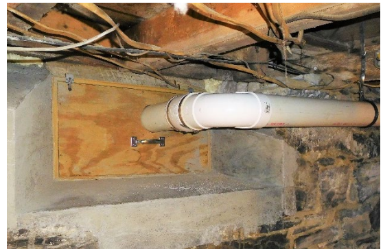
Figure 2. Example piping into a crawlspace area.